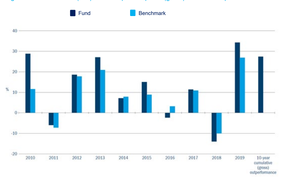
Figure 1: Threadneedle (Lux) Pan European Equities (gross) v MSCI Europe Index

The Pan European equities strategy has shown exceptional resilience during one of the most testing times ever for stock markets. Over one year to end-April 2020 it fell 4.3% (net of fees) compared to a fall of 11% for the MSCI Europe index<sup>2</sup>, this outperformance coming mainly from our stock selection skills. Longer-term figures show this is not a short-term trend, as we have demonstrated outperformance over the past decade (Figure 1).