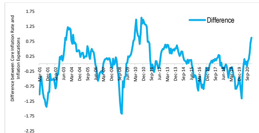
Chart of the week: Inflation expectations vs Core CPI.